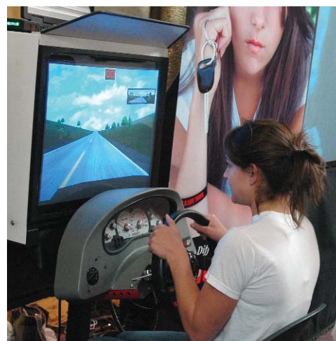
Drunk driving simulator presented by Save a Life Tour at Regis University during Alcohol Awareness Week.

frozen concoctions. R.E.A.C.H. uses peer influence as the primary means of promoting the message of responsibility and healthy lifestyles with student athletes. Unmasked! works through the medium of peer theater to help students promote messages of awareness, safety and student activism. Listening Ear trains students in listening skills to help other students with issues they often face while in college. In addition, they sponsor “Issues,” a discussion session for students to talk about their opinions on spirituality, body image, alcohol, depression and adjusting to college.