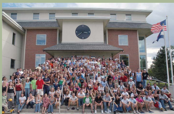
Members of the class of 2009 take time out of their busy orientation schedule to pose for a photo on the steps of Dayton Memorial Library.

Total Number Enrolled: 402 In-state students: 60% Out-of-state students: 40% Average high school GPA: 3.38 50% were 3.5-4.0 Average ACT: 23 Average SAT: 1061 Gender: Female 63% Male 37%